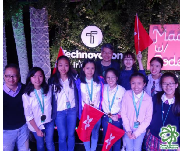
The two teams representing Hong Kong at the Technovation World Pitch Summit at Google's Mountain View headquarters.

Organiser: Young Makers & ChangeMakers | Co-organiser: Cyberport | Lead sponsor: Alibaba Entrepreneurs Fund